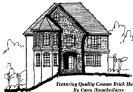
Featuring Quality Custom Brick Homes By Costa Homebuilders

We Now Have A Variety Of Newly Developed Home Sites To Choose from in Phase Two